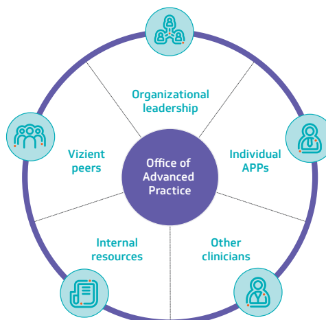
Figure 1. Providing connective tissue among multiple entities