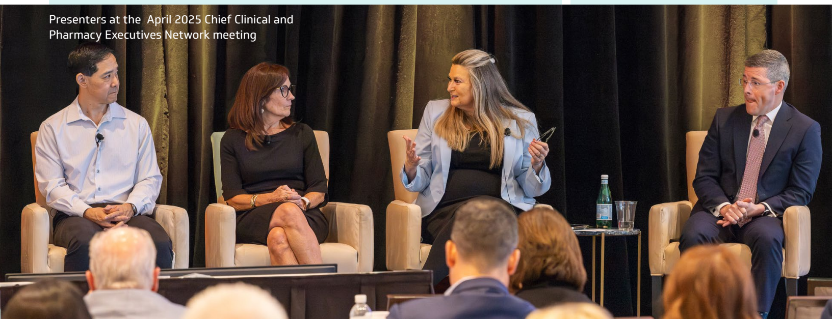
Presenters at the April 2025 Chief Clinical and Pharmacy Executives Network meeting