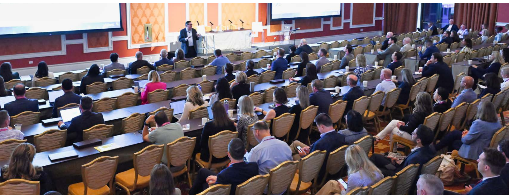
Operations Executives peer-to-peer session at the 2025 Vizient Connections Summit